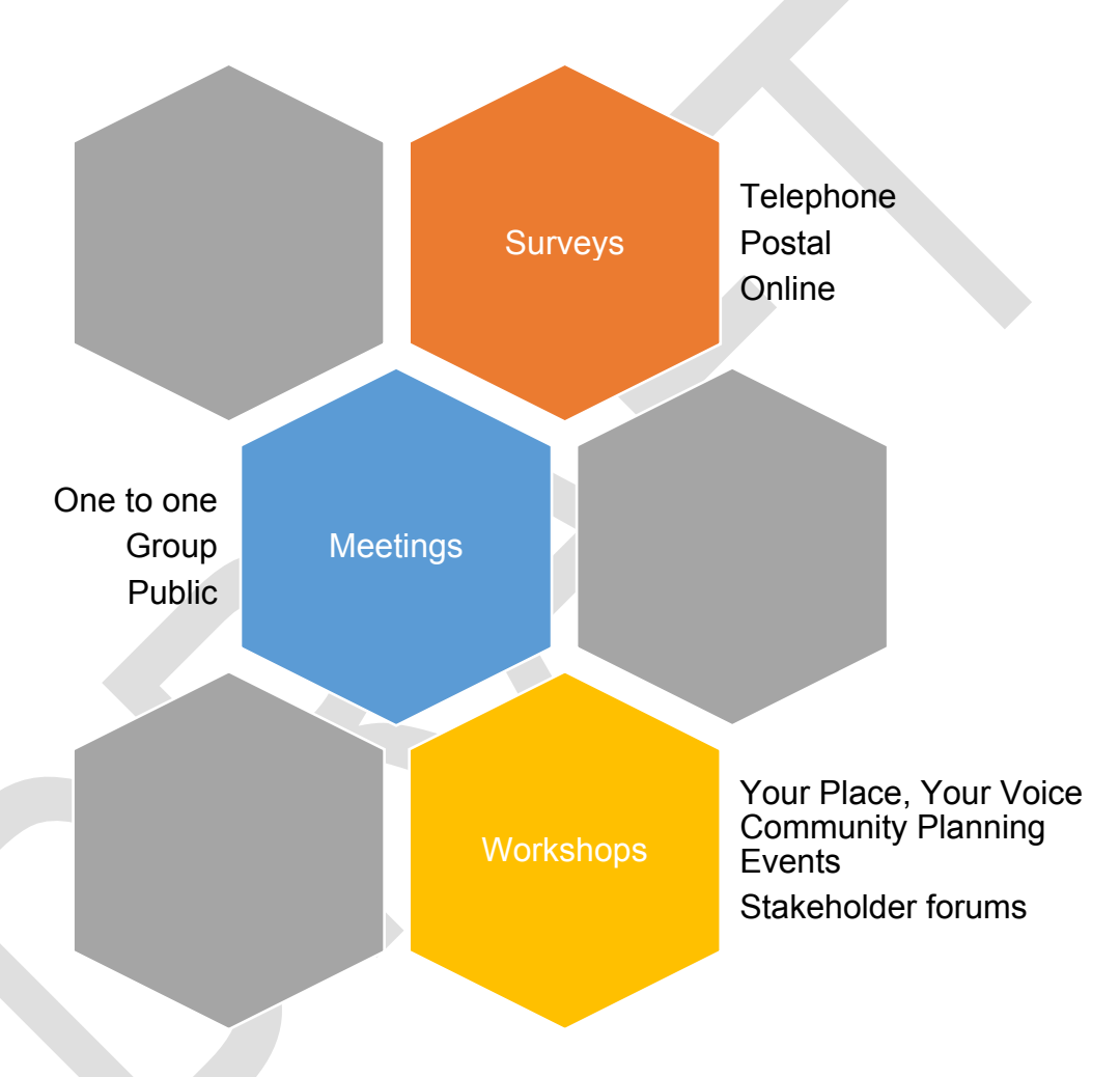
Figure 1 – Consultation techniques

'Your Place, Your Voice' community planning events